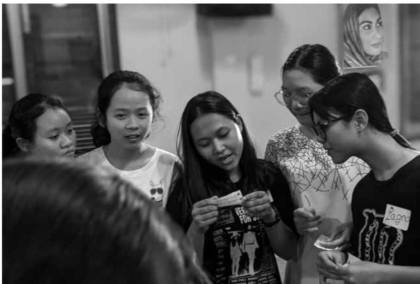
Female students at Harpswell Foundation participating in a training on “Verification of Information on Social Media” (Phnom Penh, December 2019).