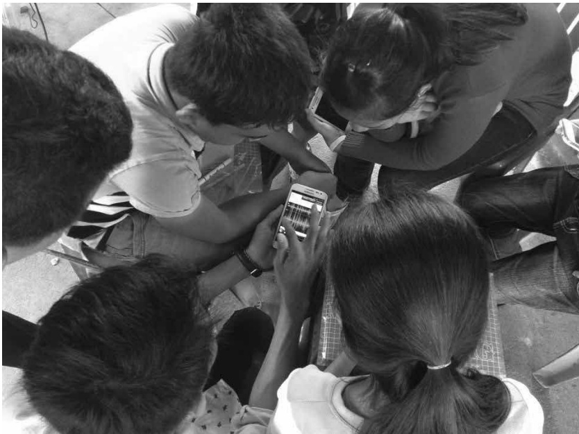
Facilitator guiding young trainees on how to use WavePad app to record or edit a sound from their smartphone (Svay Rieng, June 2015).