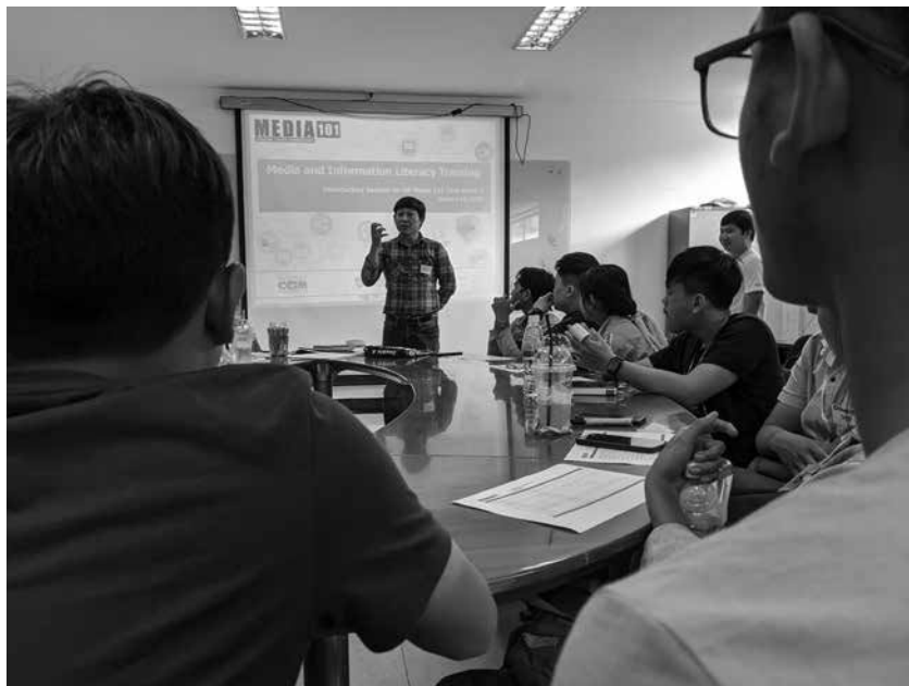
The second batch of the students in the Media 101 Club at University of Puthisastra in a club orientation (Phnom Penh, January 2020).