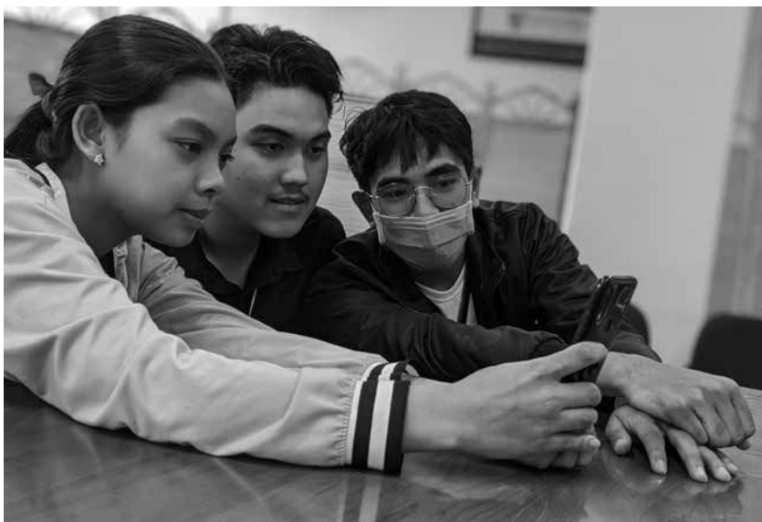
Students [Batch 2] at University of Puthisastra practicing how to edit pictures from their smartphone (Phnom Penh, February 2020).