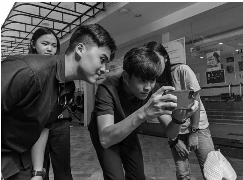
Students [Batch 2] at University of Puthisastra participating in the photography session and applying composition rules (Phnom Penh, February 2020).