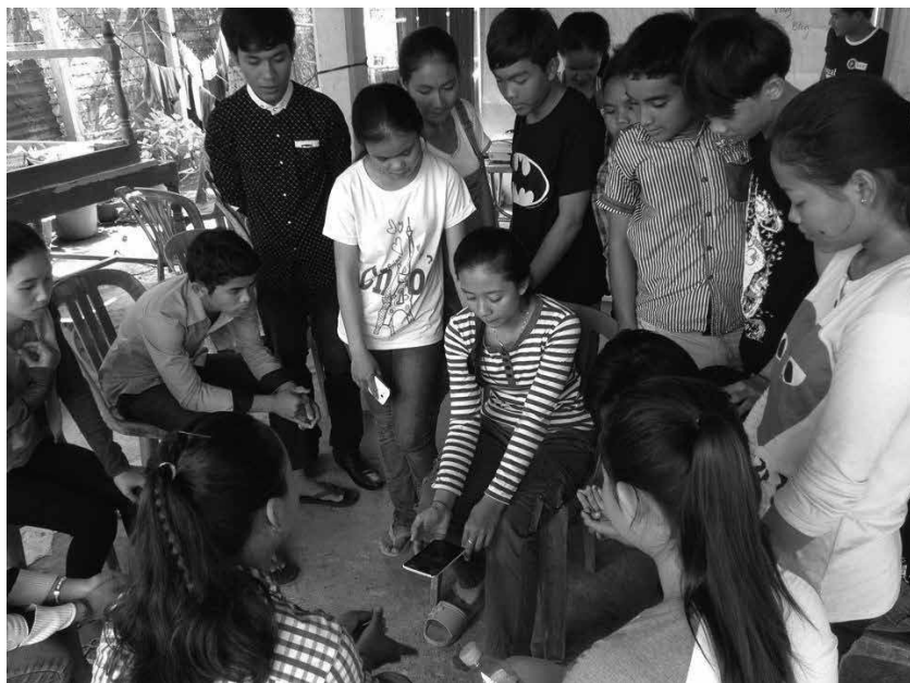
Young female facilitator guiding trainees on how to create a YouTube account for Vlog, to help them share and express their personal experiences and opinions (Svay Rieng, October 2015).