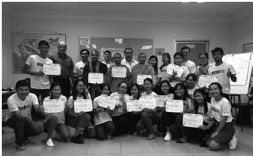
Members of the Media 101 Club [Batch 1] at Paññāsāstra University of Cambodia successfully completed a three-month media and information literacy training (Phnom Penh, April 2019).