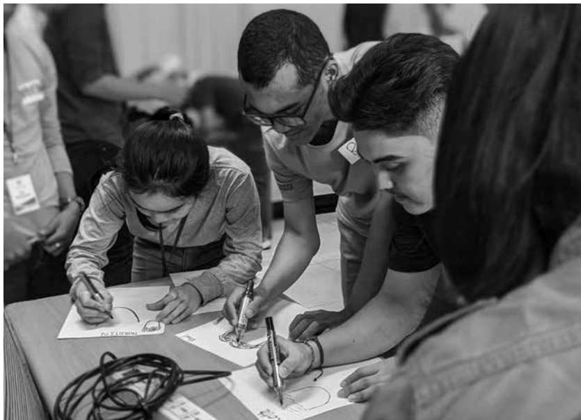
University of Puthisastra students [Batch 2] in the Media 101 Club playing a topic game called “Drawing Portraits” (Phnom Penh, January 2020).