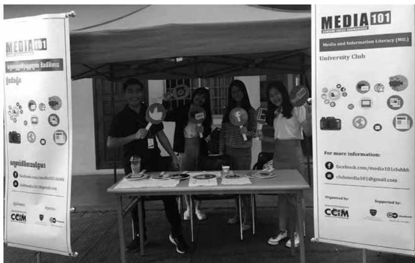
Media 101 Club alumni [Batch 1] at University of Puthisastra running a booth to announce and recruit new students for Batch 2 (Phnom Penh, December 2019).

brainstorming, group discussion and presentation, debates, media products. These booths always attract a lot of attention. They show that students are very keen to learn about various topics such as Photography, Video, and Verification of Information on Social Media.