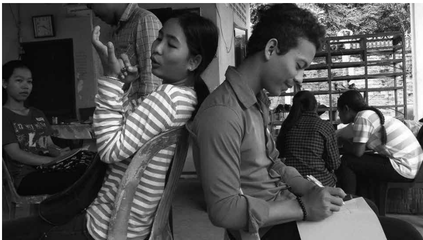
Youth club leaders in Svay Rieng province playing a topic game and guessing what a picture on the flip chart was (Svay Rieng, September 2016).